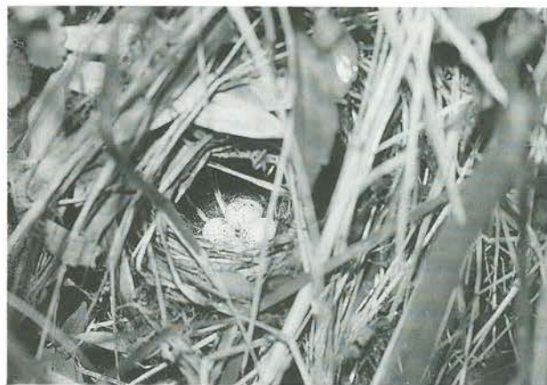
Figure 6. Nest (number 2) with eggs of Phylloscopus sichuanensis , Wolong, Sichuan Province, China, 25 June 1990.

found (two on Emei Shan and one in Wolong) were all in mossy trees, c. 2, 3 and 4 m, respectively, above the ground. Ali & Ripley (1983) state that the nest of P. chloronotus ( simlaensis ) is usually placed in the outer branches of a conifer 2–15 m, but mostly 3–6 m, above the ground.