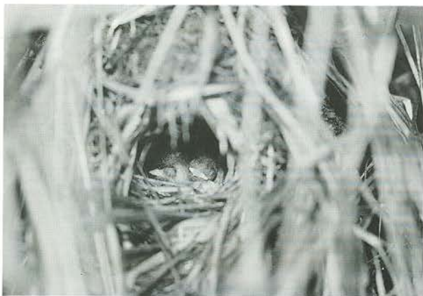
Figure 5. Nest (number 1) with young of Phylloscopus sichuanensis , Wolong, Sichuan Province, China, 24 June 1990.

The placing of the nest thus appears to differ from that of P. chloronotus . Three nests of P. chloronotus that we have