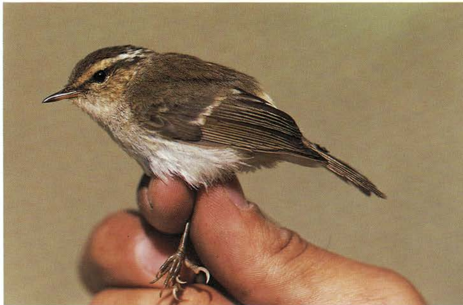
Plate I. Dorsal and lateral views of Phylloscopus sichuanensis , female, Wolong, Sichuan Province, China, 24 June 1990.