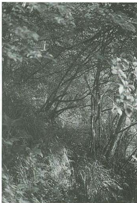
Figure 4. Breeding site of Phylloscopus sichuanensis , Wolong, Sichuan Province, China, 24 June 1990. Nest (number 1) situated in tuft of dead grass in bottom/centre.

noted) on 11 June, was on a slope with young deciduous secondary growth and knee-high grass, ferns and herbs (Fig. 4). On return to the site on 24 June there were at least four young in the nest (Fig. 5). The second nest, on a steep bank overgrown by grass, mosses, herbs and ferns by a trail on a mountain side, was found on 25 June and revisited the following day. It contained four eggs (Fig. 6).