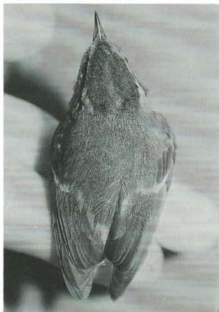
Figure 1. Phylloscopus sichuanensis , female, Wolong, Sichuan Province, China, 25 June 1990.

Female (sexed by incubation patch), trapped by P.A. and U.O. on 25 June 1990 in Wolong Nature Reserve, Sichuan Province, China. Altitude c. 2500 m. ZMUC catalogue number PA 12-25.06.90. See Figure 1.